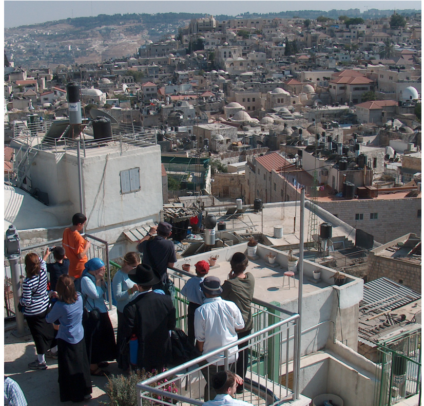
Settlement in the Muslim Quarter