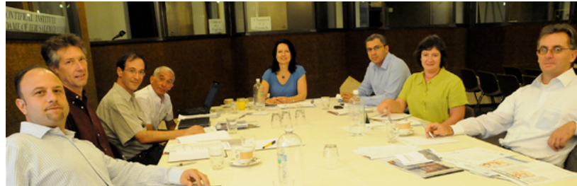
Participants in the October Roundtable