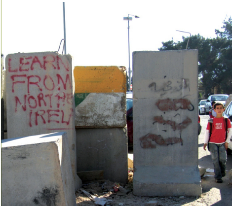
Entrance to Issawiya, Jerusalem