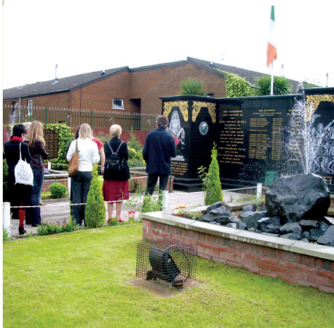
Conflict in Cities, Belfast Workshop

Everyday Life and the Possibilities for Transformation in Belfast, Jerusalem and Other Divided Cities