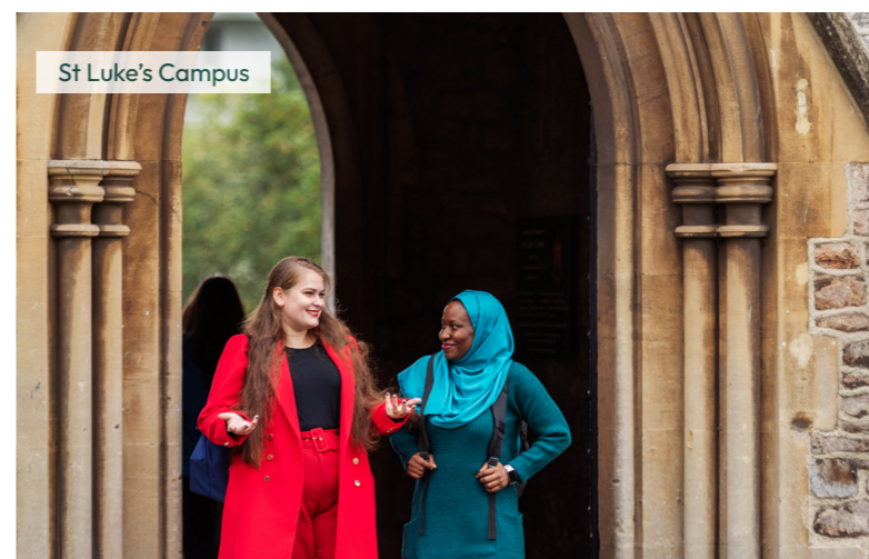
St Luke's Campus