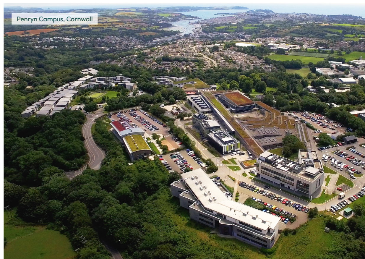
Penryn Campus, Cornwall