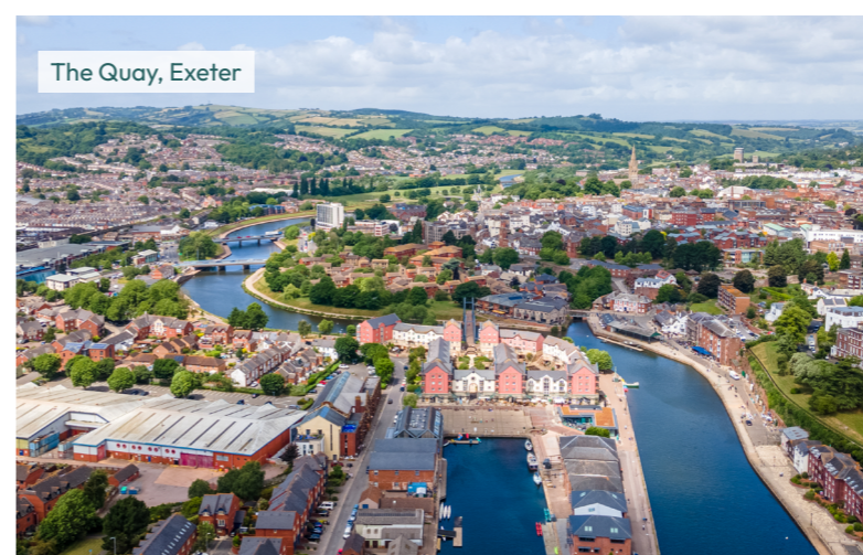
The Quay, Exeter

Applications for students starting in 2025 open in November 2024 with deadlines throughout 2025.