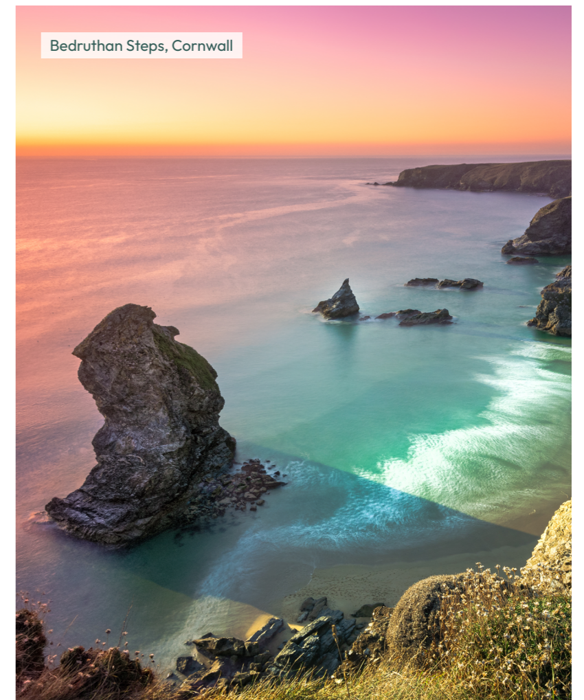
Bedruthan Steps, Cornwall