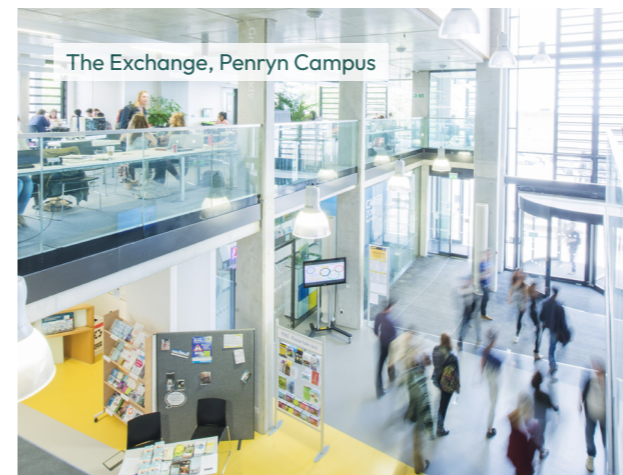
The Exchange, Penryn Campus