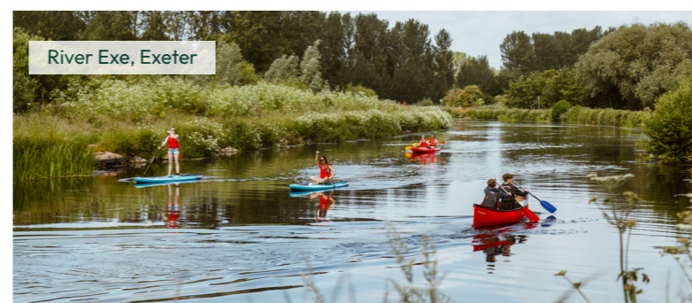
River Exe, Exeter