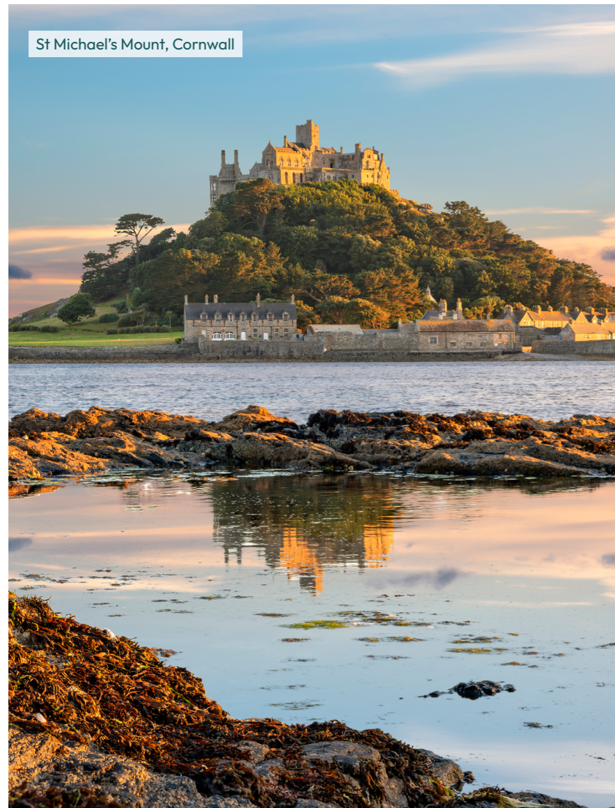
St Michael's Mount, Cornwall