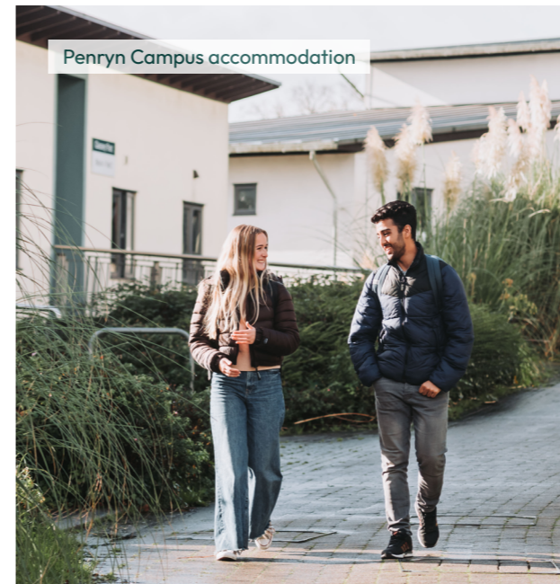
Penryn Campus accommodation