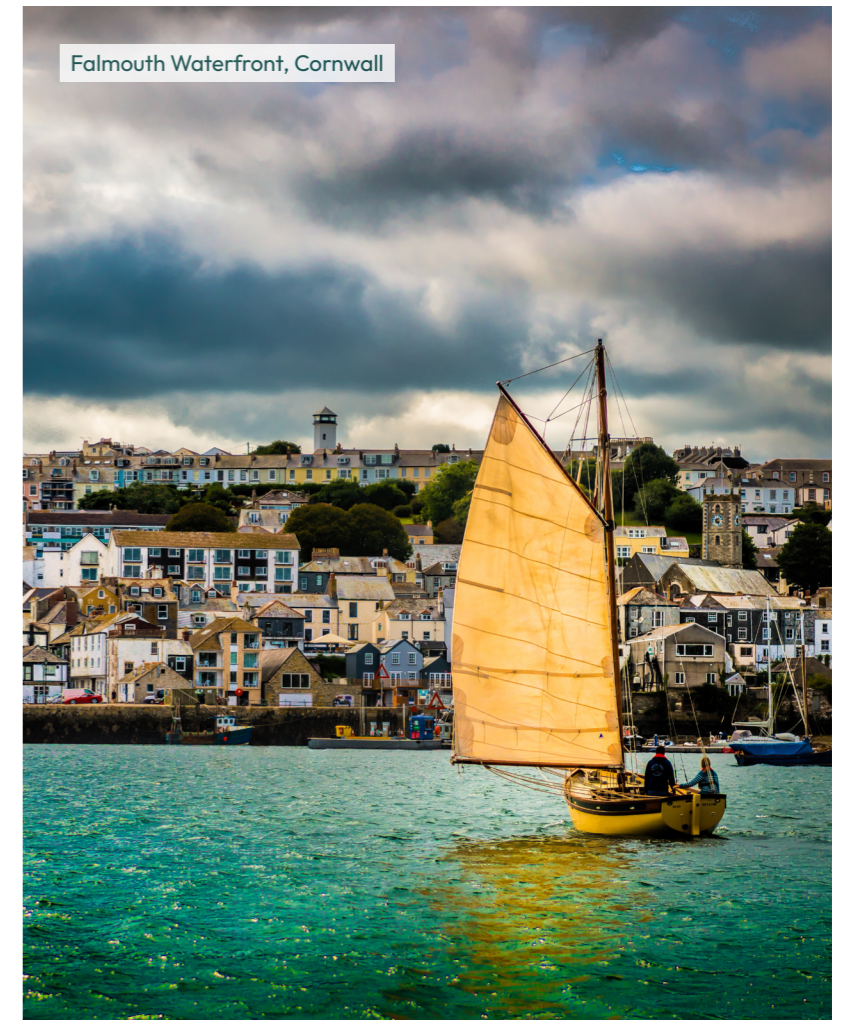
Falmouth Waterfront, Cornwall