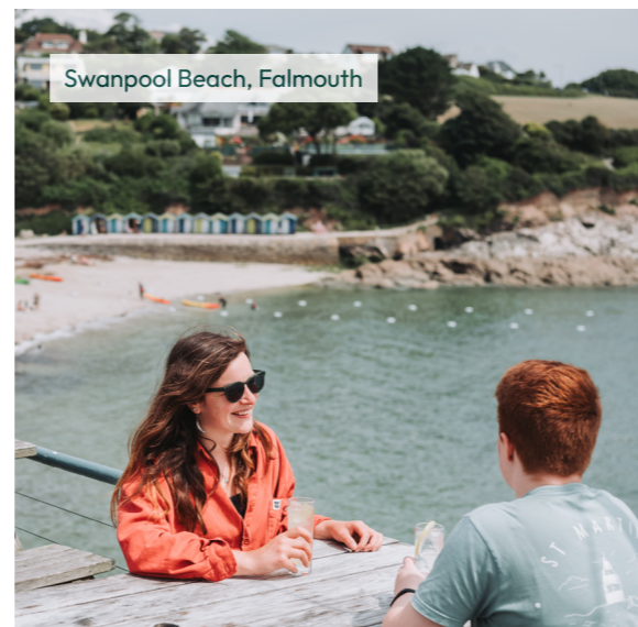
Swanpool Beach, Falmouth