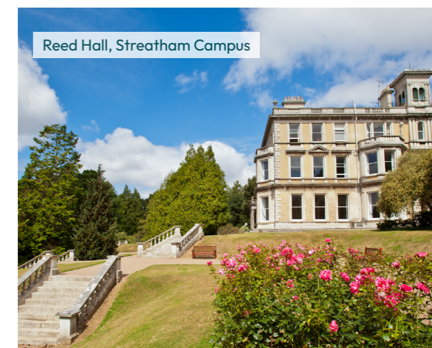
Reed Hall, Streatham Campus