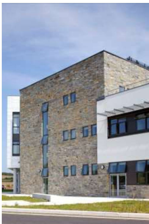
The south wing