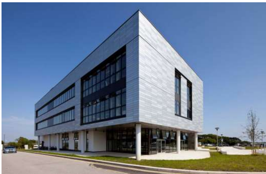
The north wing