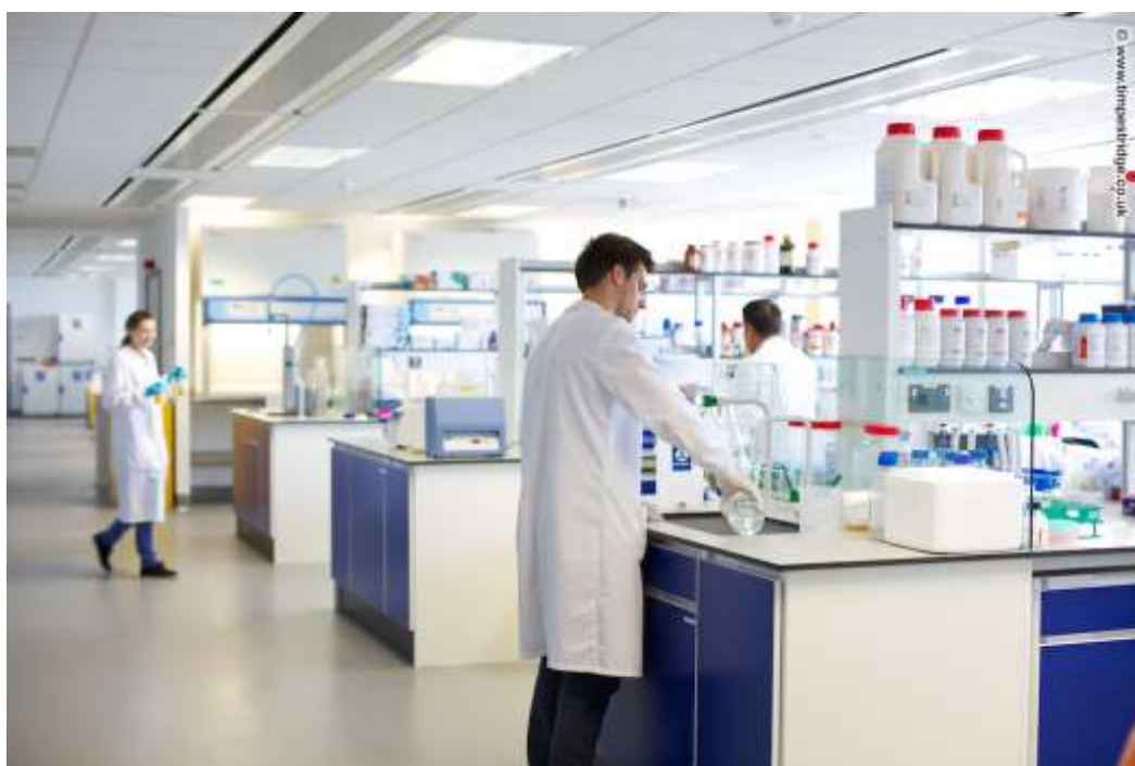
The second floor laboratory