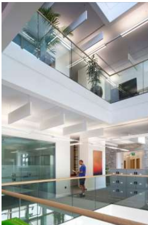
View across the atrium from the first floor