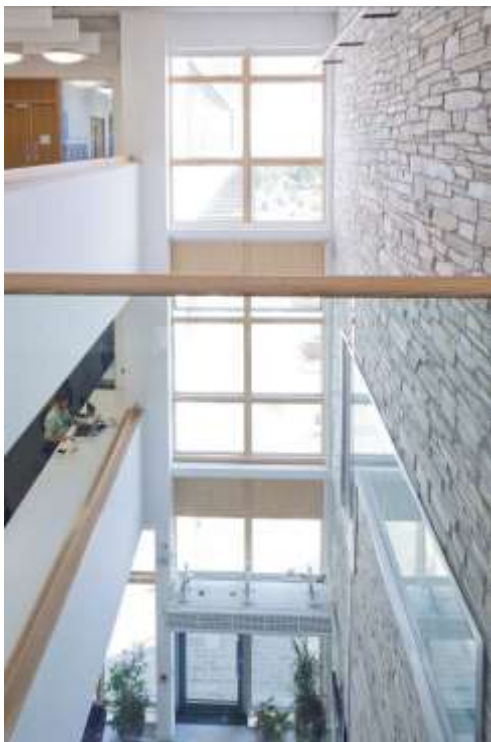
View from the second floor balcony