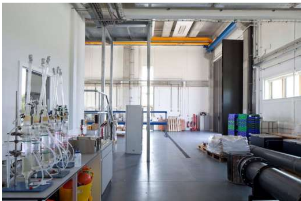
The Research Hall