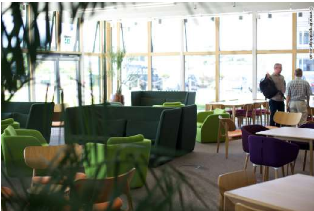
The Interactive Space