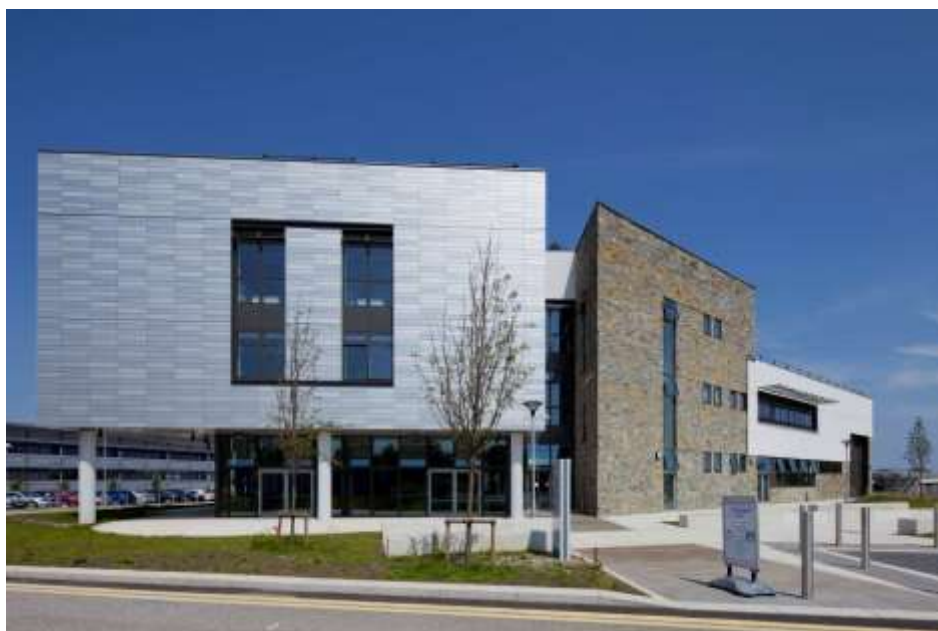
The entrance to the ESI