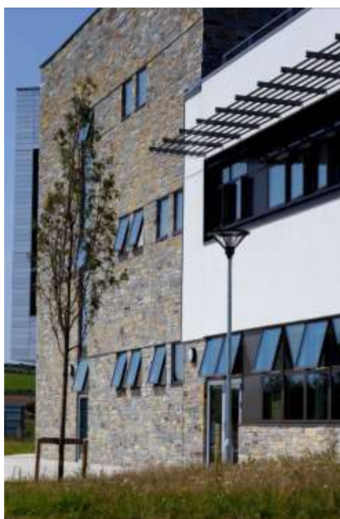
Detail of the brise soleil (sun-shades)