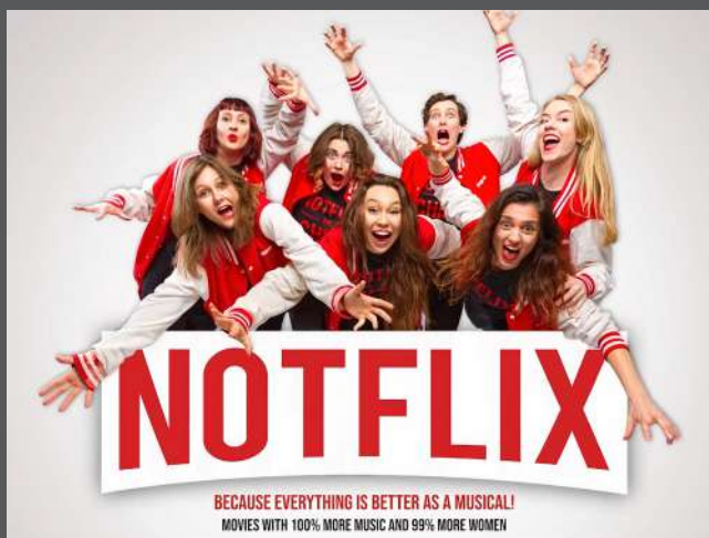
The 'Spice Girls of improv' in their five-star musical comedy Notflix , at AMATA in November.