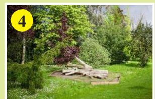
Site 4: Old Botanic Garden, Poolle Gate