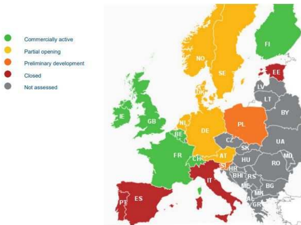
Figure 1: Demand Response in Europe

A 2017 study of explicit DSR in Europe conducted by the Smart Energy Demand Coalition (SEDC, 2017), highlights the range of regulatory procedures currently in operation regarding the access of aggregators to European DSR markets 6 . Figure 1 gives an overview of the development of European DSR as of 2017 according to SEDC's analysis.