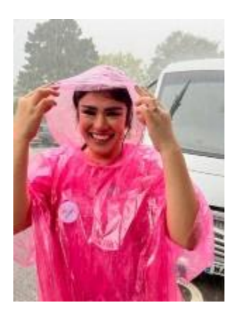
Smiling through the torrential rain on Sunday